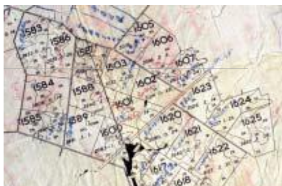
ABOVE: PLAN OF BLOCKS FOR SELECTION