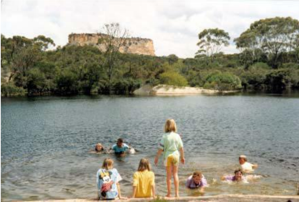
FITZGERALD RIVER NEAR ROE'S ROCK